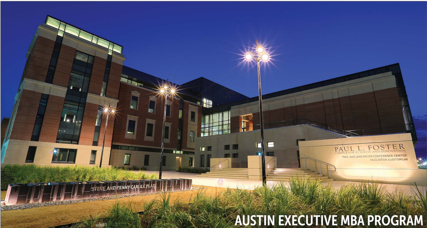
This campus no longer hosts in person classes and will not have statistical data beyond May 2023.